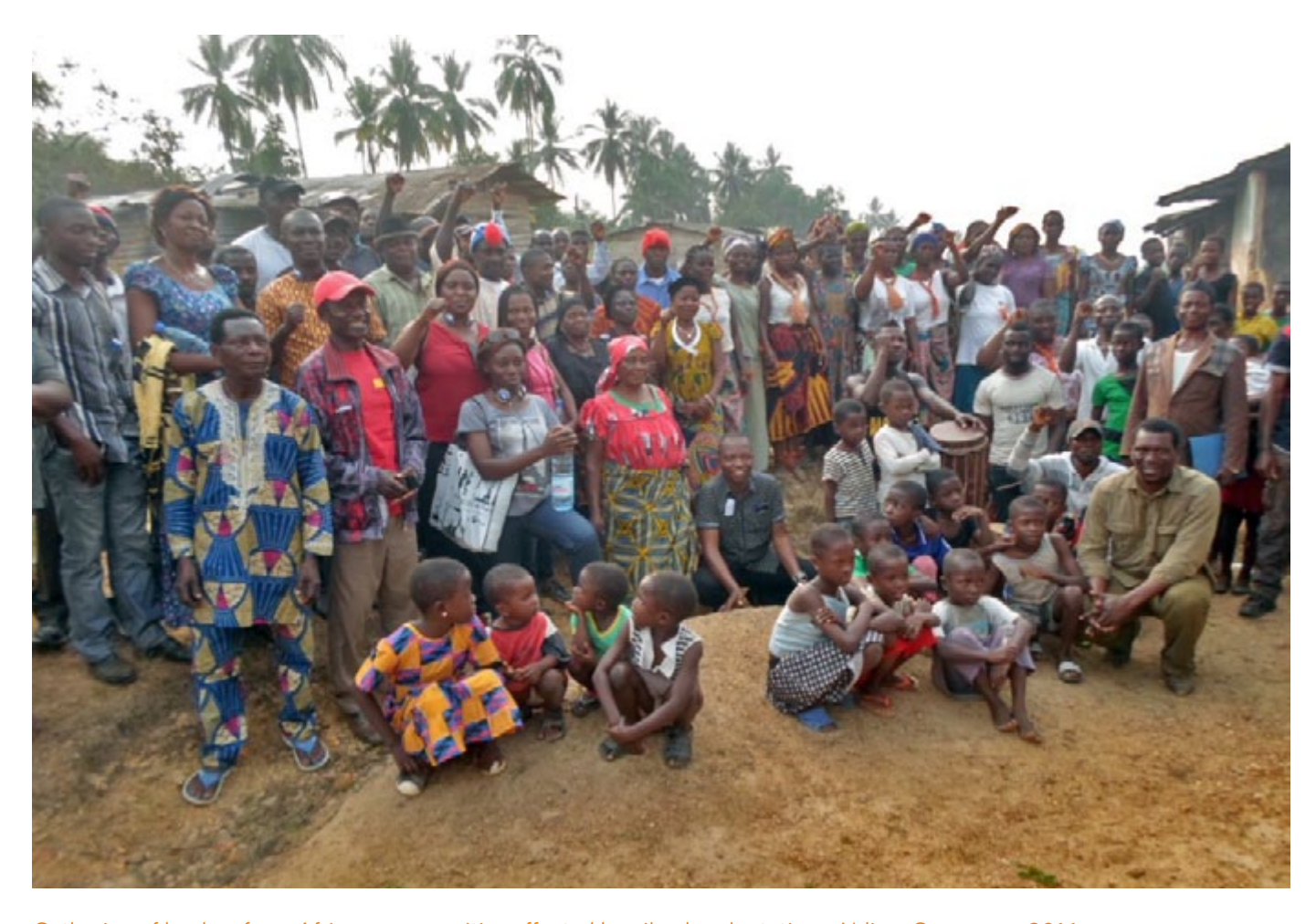
Gathering of leaders from African communities affected by oil palm plantations, Ndian, Cameroon, 2016