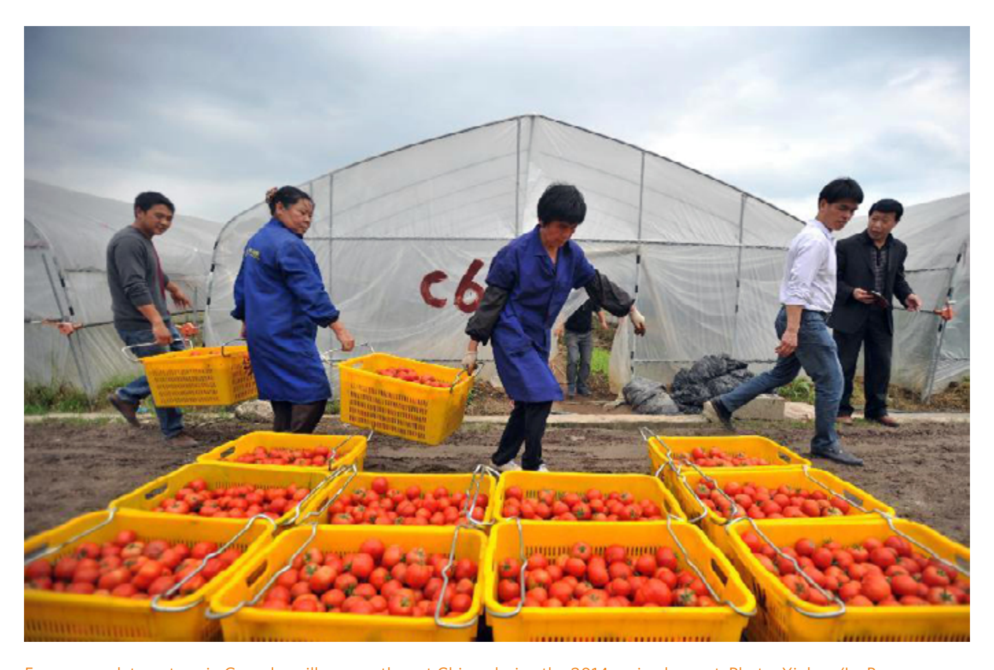
Farmers pack tomatoes in Guandao village, southwest China, during the 2014 spring harvest.