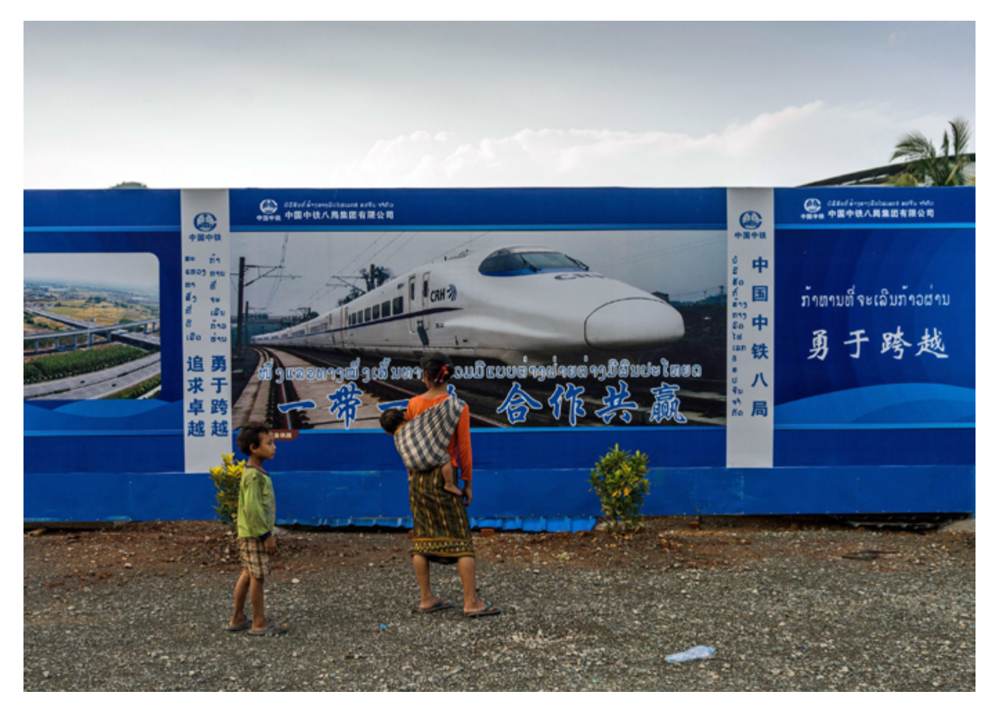
Poster for a Chinese high-speed train at the construction site for a bridge over the Mekong River near Luang Prabang, Laos.

million hectares in 31 countries.<sup>12</sup> It is unclear exactly how many of these deals are directly tied to BRI-associated projects, but BRI is certainly helping to increase China's control over the world's farmland.