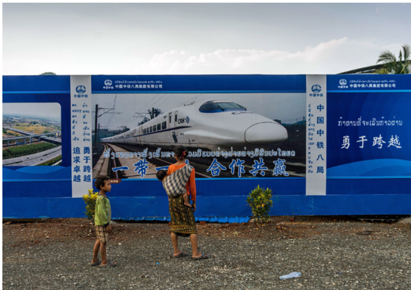
Poster for a Chinese high-speed train at the construction site for a bridge over the Mekong River near Luang Prabang, Laos.

million hectares in 31 countries. 12 It is unclear exactly how many of these deals are directly tied to BRI-associated projects, but BRI is certainly helping to increase China's control over the world's farmland.