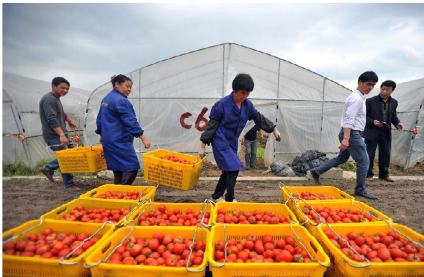
Farmers pack tomatoes in Guandao village, southwest China, during the 2014 spring harvest.