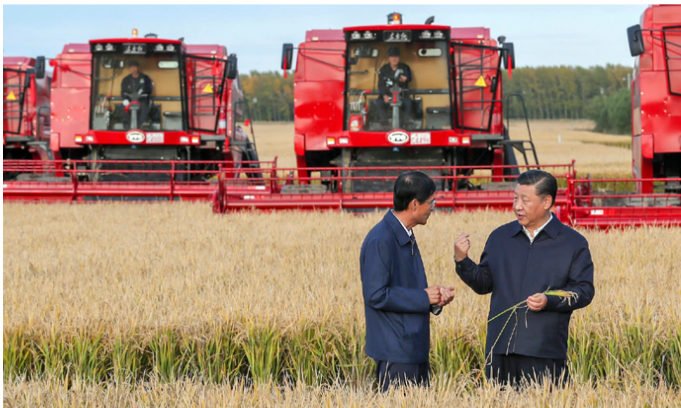
Chinese President Xi Jinping visits Heilongjiang province, China, in September 2018.

nine special economic zones. 6 Projects include the construction of a fertiliser plant with an annual output of 800,000 tons; large-scale vegetable and grain processing plants in Asadabad, Islamabad, Lahore and Gwadar; and a meat processing plant in Sukkur. Hundreds of thousands of hectares of farmland will be needed for these projects, with many farmers likely displaced.