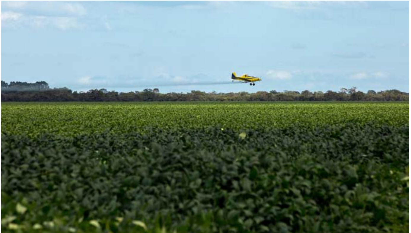
Aerial spraying of pesticides on a soybean plantation in Piauí, Brazil.

several different Brazilian-based Harvard subsidiaries. In a decision handed down on 16 May 2018, the Agrarian Court Judge of Piauí stated that one of these subsidiaries, Sorotivo Agroindustrial Ltda, had used the practice of grilagem to acquire around 27,000 hectares of land within Fazenda Ipê that were previously public lands. 30