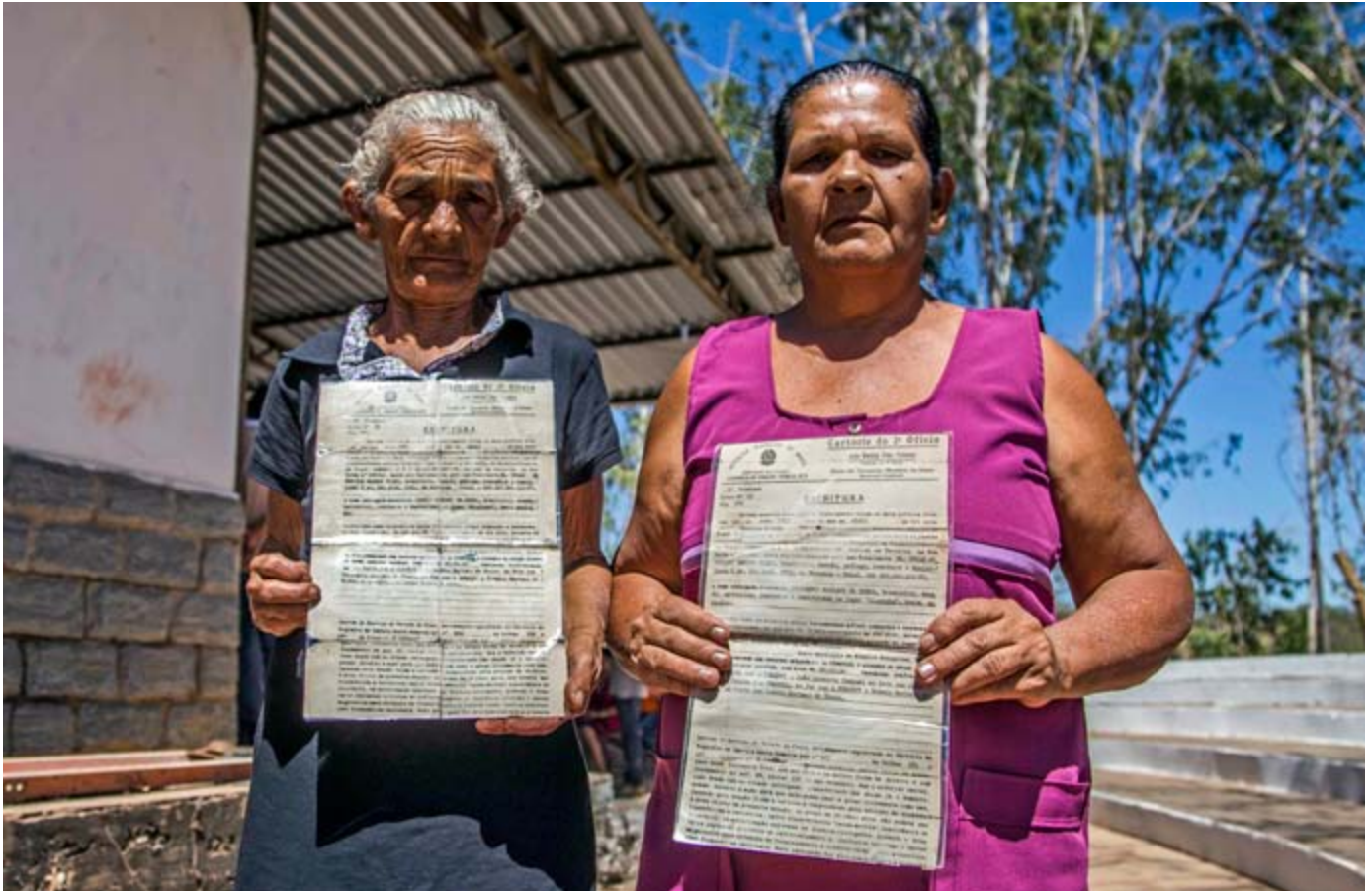
Two women from the village of Santa Fé in the municipality of Santa Filomena display their land certificates, September 2017. The people of Santa Fé have lived in this part of the Brazilian state of Piauí for over 200 years but are now affected by a recent wave of land grabbing in the area, led by Brazilian businessmen and financed by foreign companies, such as Harvard's endowment fund and the US-based pension fund manager TIAA.

push for formation of a local water district that would allow Harvard's properties to ultimately benefit from government grants and taxpayer funds; inducing certain property owners to sell with offers that are many times the going market rates and using this method to acquire properties that contain public water infrastructure; and generally not being forthcoming with the local populace about how these investments could affect the most vital of resources—all in the name of returns on investment." 21