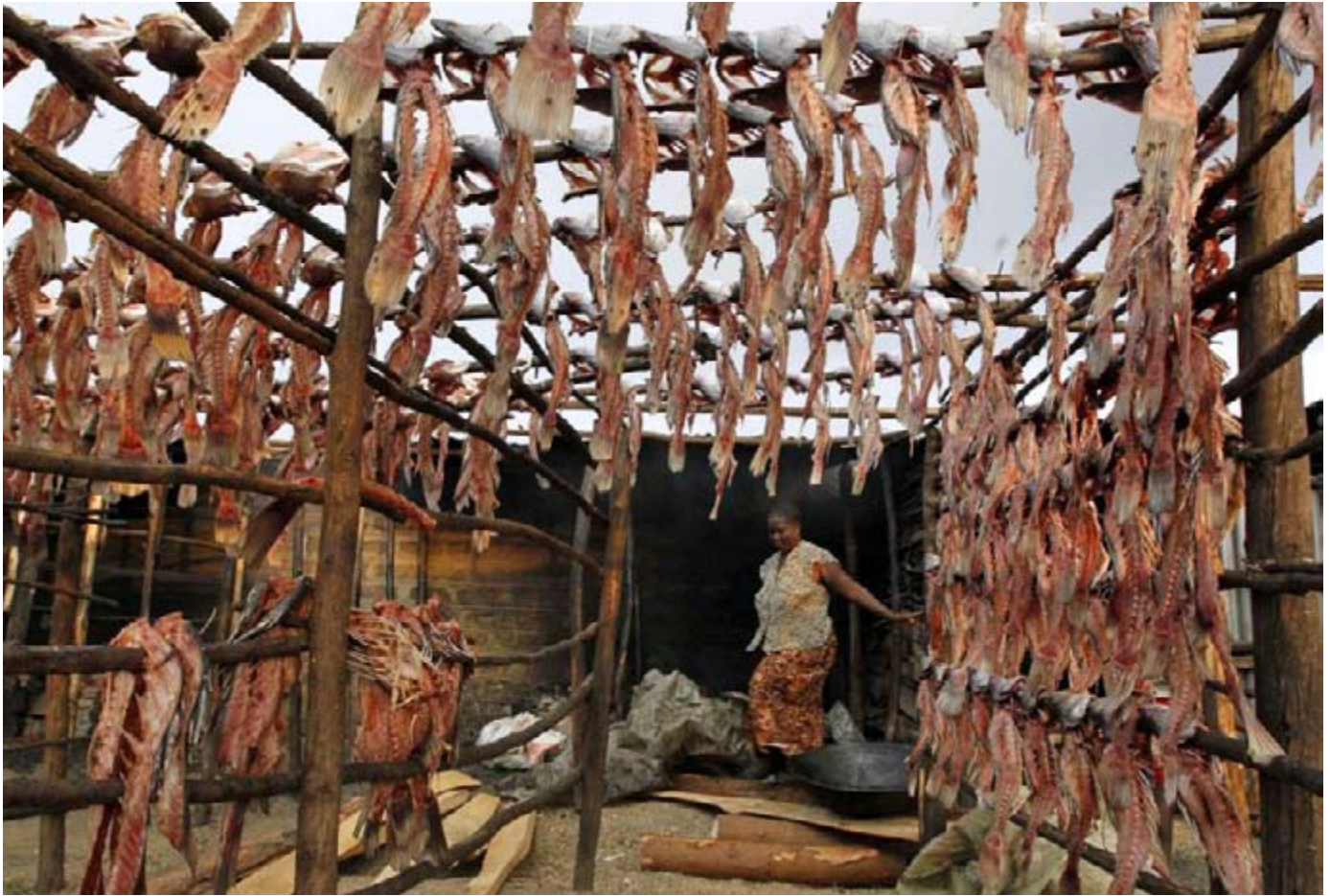
Fish skeletons set out to dry on wooden poles in a market in Kisumu, Kenya. The fish skeletons, referred to as “mgongo wazi”, are sun-dried and deep-fried before being sold as affordable food.

other products like potatoes. With such a liberalisation schedule, value addition through agro-processing will be constrained and will also compromise food security given the supportive linkages between agriculture and manufacturing.