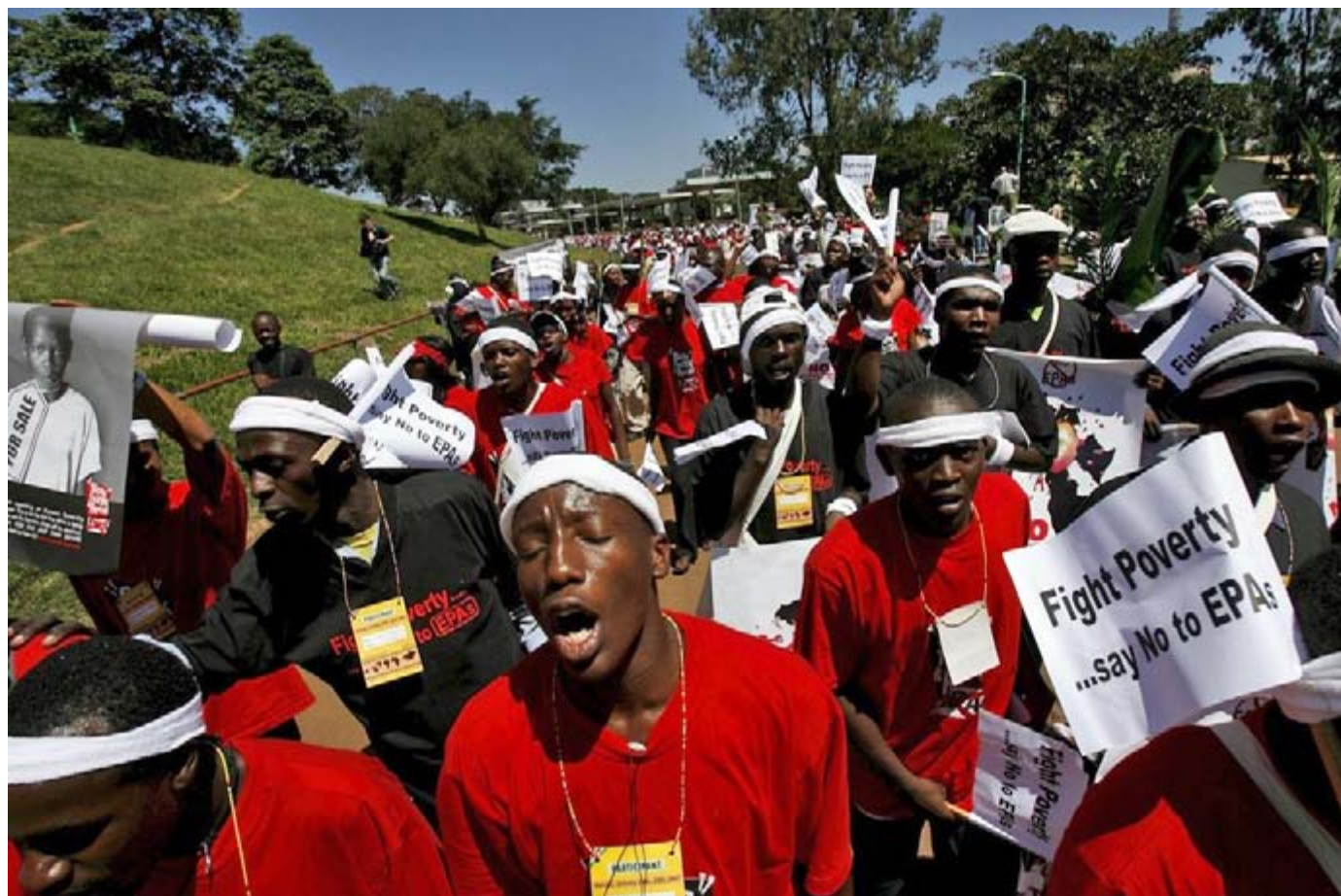
World Social Forum 2007: Delegates demonstrate in Nairobi against EPAs.

The EU's Economic Partnership Agreements with Africa