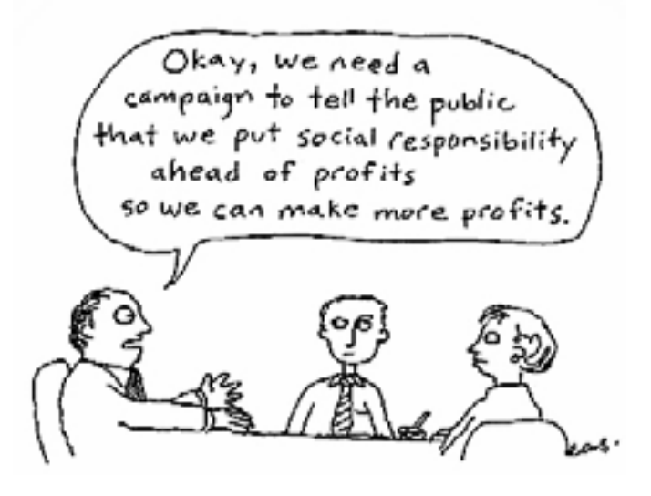
Okay, we need a campaign to tell the public that we put social responsibility ahead of profits so we can make more profits.

16. Sylvia Kay, "Political brief on the principles on responsible investment in agriculture and food systems," TNI, March 2015, <u>https://www.tni.org/en/briefing/political-brief-principles-responsible-investment-agriculture-and-foodsystems.</u>