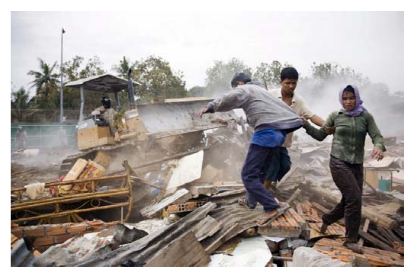
Corporate actions to reduce "reputational risk" are rarely synonymous with communities keeping control of their lands.

land grab label. It is true that since 2008, public pressure has, in some cases, succeeded in getting companies to pull out of land deals and projects. Evidence from the ground, however, makes it clear that corporate actions to reduce "reputational risk" are rarely synonymous with communities keeping control of their lands.