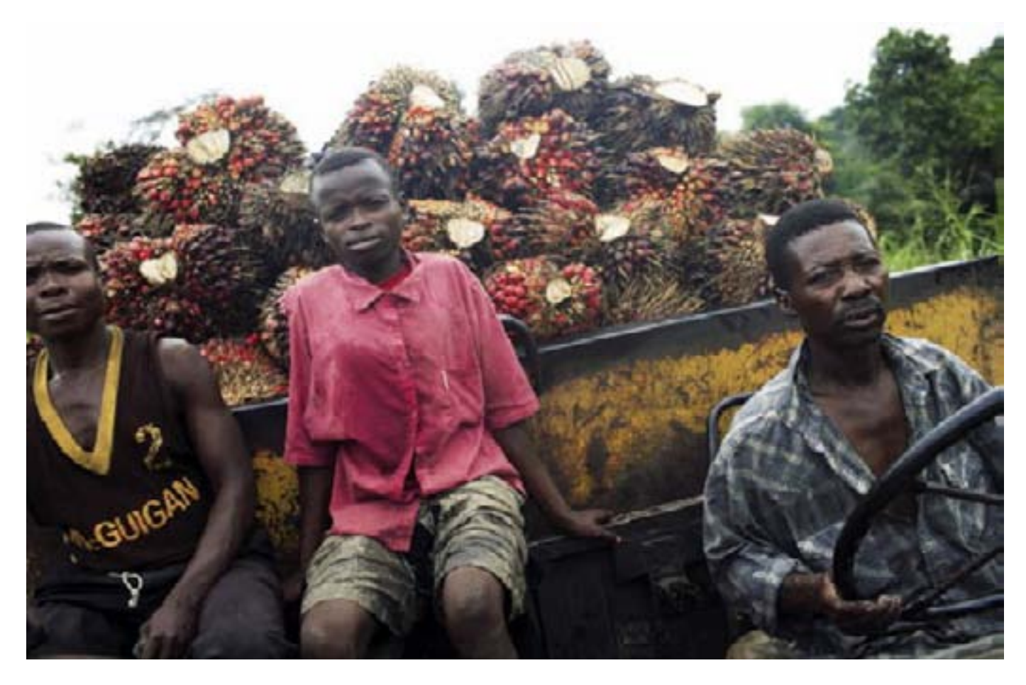
As one of the Roundtable for Sustainable Palm Oil's longstanding NGO members admits, "industry non-compliance with the RSPO standards is ubiquitous."

rights of peasants and indigenous peoples to their lands. Yet it makes no mention of land redistribution and provides no tangible support to peasant production, upholding instead the existing market-based system which has only accelerated land concentration in the countryside.<sup>14</sup>