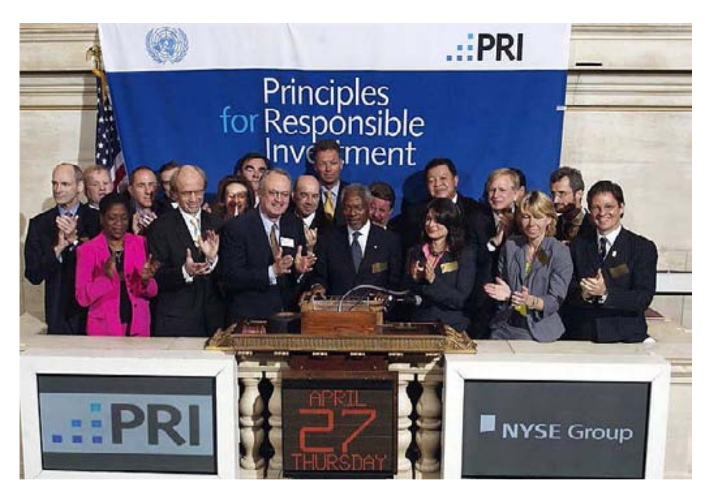
The number of signatories to the United Nations Principles for Responsible Investment (UN PRI) rules on farmland doubled between 2011 and 2014, and the UN PRI has now incorporated those rules into its general guidance for all investors.

one-third of the projects had no connection to social responsibility; while for another 20% of projects there was no information available about their SRI status. Similarly, a recent UNCTAD-World Bank study of large-scale agricultural investments looked at 39 established projects in Africa and Asia and found that less than one-third (30%) were affiliated with a certified SRI scheme.<sup>8</sup> This means that the majority of farmland deals either proclaim to adhere to standards of corporate social responsibility without being subject to scrutiny, or fall outside any SRI frame.