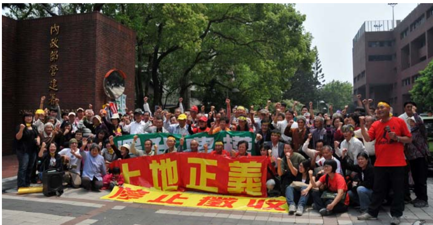
Taiwanese farmers protesting loss of their land to industrial development.

Asia is a land of small farmers. But across the continent, governments are introducing changes to land laws that threaten to displace millions of peasants and undermine local food systems. Asia is witnessing an agrarian reform in reverse.