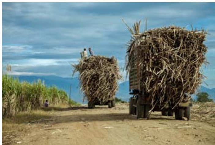
Trucks loaded with sugar cane in Kampong Speu Province, Cambodia

In Japan, the government's decision to revise its agriculture land law was tightly connected to its participation in the Trans Pacific Partnership (TPP). Although the TPP is still in early negotiations, Japan is already preparing for an eventual decrease in tariffs on agricultural produce by encouraging a shift from small scale farming to corporate farming, which it views as more internationally competitive. The government is thus loosening various regulations on the entry of private-sector firms into farming, encouraging farmland consolidation and establishing two strategic special zones for corporate farming. 4 These zones will include approximately 1.5 million ha of farm land – a third of the total 4.6 million ha currently under cultivation in the country. 5