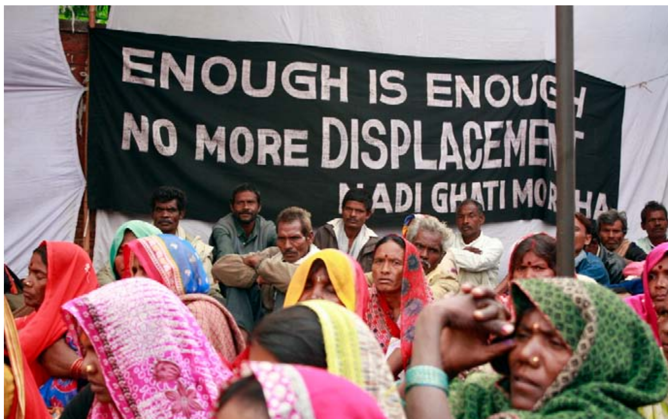
January 2015: Indian farmers protest against displacement.

None of these arguments hold up to scrutiny. Farmers across Asia are fighting for their land, not trying to flee it. The fact is, the growing adoption of industrial farming systems and increasing corporate control of distribution of food – changes supported by the new land laws – have led to a reliance on expensive inputs, the degradation of land and biodiversity and volatile price changes for produce. The impact on peasant farmers has been catastrophic, in some places triggering a wave of suicides among indebted farmers forced to give up their land.