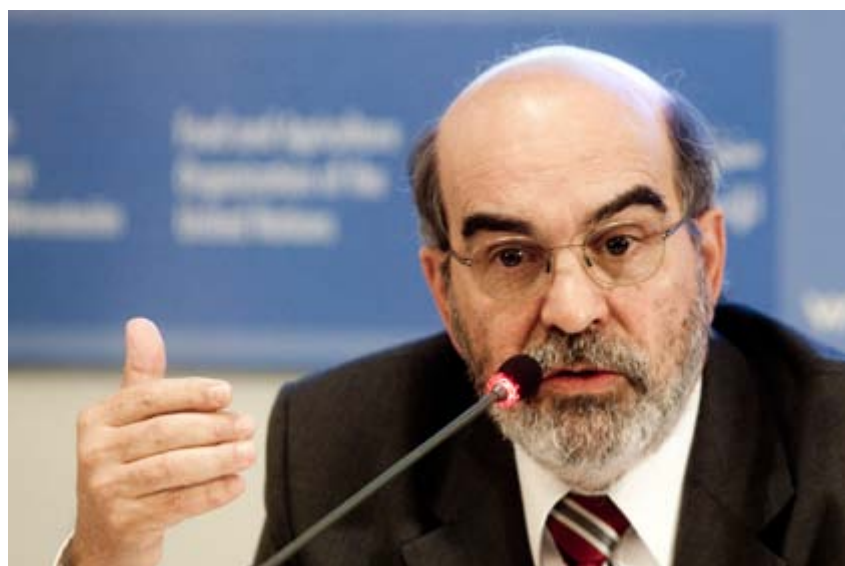
Food and Agriculture Organization Director-General José Graziano da Silva

Some of the most active promoters of corporate farming are intergovernmental bodies, such as the United Nations FAO and IFAD or the World Bank and Asia Development Bank. These agencies provide key technical, financial and policy support to implement the legislative changes. While the FAO carried the banner for the International Year of Family Farming in 2014, its Director General was cautioning Asian governments about “fragmented” landholdings and urging them to pursue more economically viable public-private partnerships for agriculture.