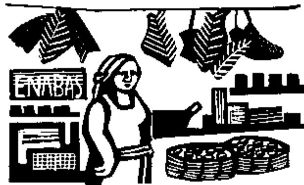
Corner store (Drawing: Rini Templeton)

soft drinks. 17 The government portrayed its actions as a tough measure to curb sales of junk foods. But without complementary actions to encourage healthy alternative options to the processed foods that have flooded the Mexican market and the country's poorest neighbourhoods in particular, the tax seems to be merely a grab for a share of the lucrative junk food trade that the government's own policies have facilitated. The only difference is that Mexican consumers will have to pay more for the foods that are killing them.