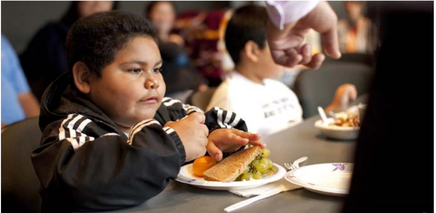
Twenty-nine percent of Mexican children between the ages of 5 and 11 are overweight. At the other end of the scale, two million children are underweight or malnourished.