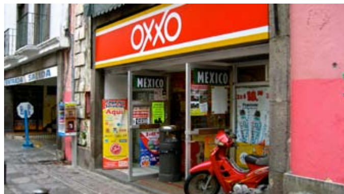
Oxxo (owned by Coca-cola subsidiary Femsa) opens an average of 3 new stores per day - it will open its 14 thousandth store in Mexico sometime in 2015.

distributes not only soft drinks to tiendas but also its Sonric line of candies, multiple varieties of its Sabritas potato chips and other related snacks and. Each product line has enormous sales because of what the industry calls "the absolute domination of the sales point". Availability has become a crucial factor in buying and consuming. People will eat what they have at hand, and the available goods are almost only processed foods.