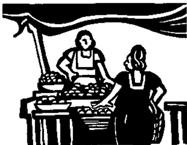
Street vendor (Drawing: Rini Templeton)

"Tiendas have proved critical to the spread of comidas chatarra [junk food]; they are the means by which transnationals and domestic food companies sell and promote their foods to poorer populations in small towns and communities," said Corinna Hawkes in 2006. "Over 90% of all Coca Cola and PepsiCo sales [by the early 2000s] were from tiendas ". 23