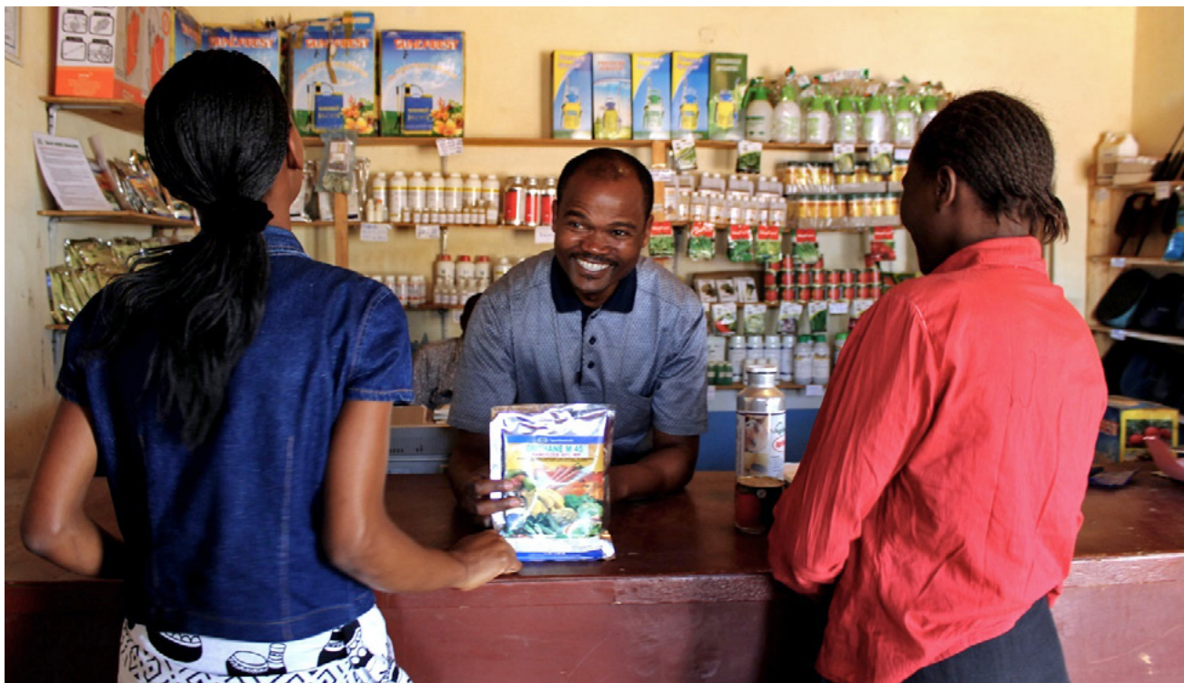
An agro-dealer in Malawi.