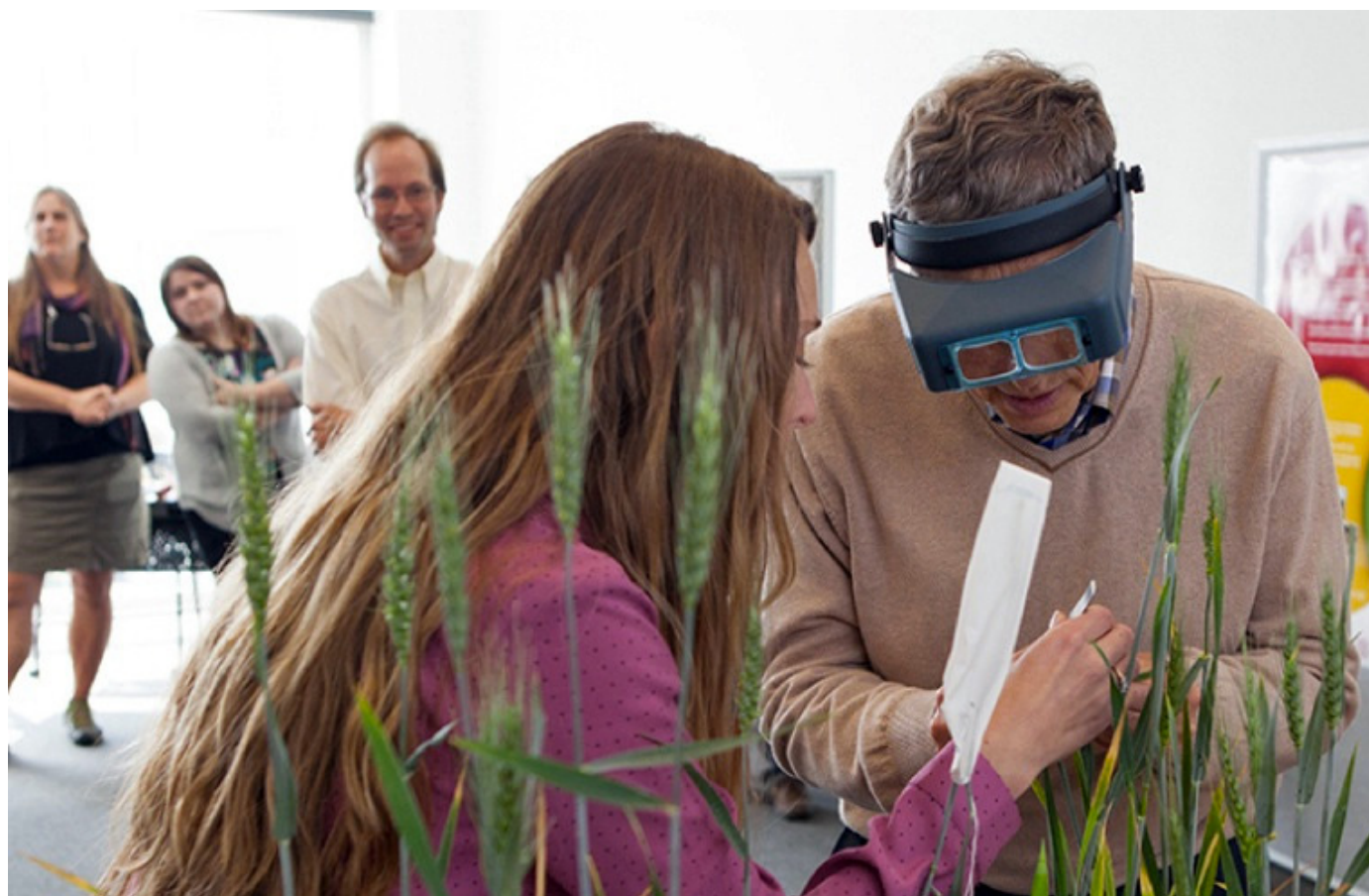
Bill Gates at Cornell University, trying to cross-pollinate wheat.