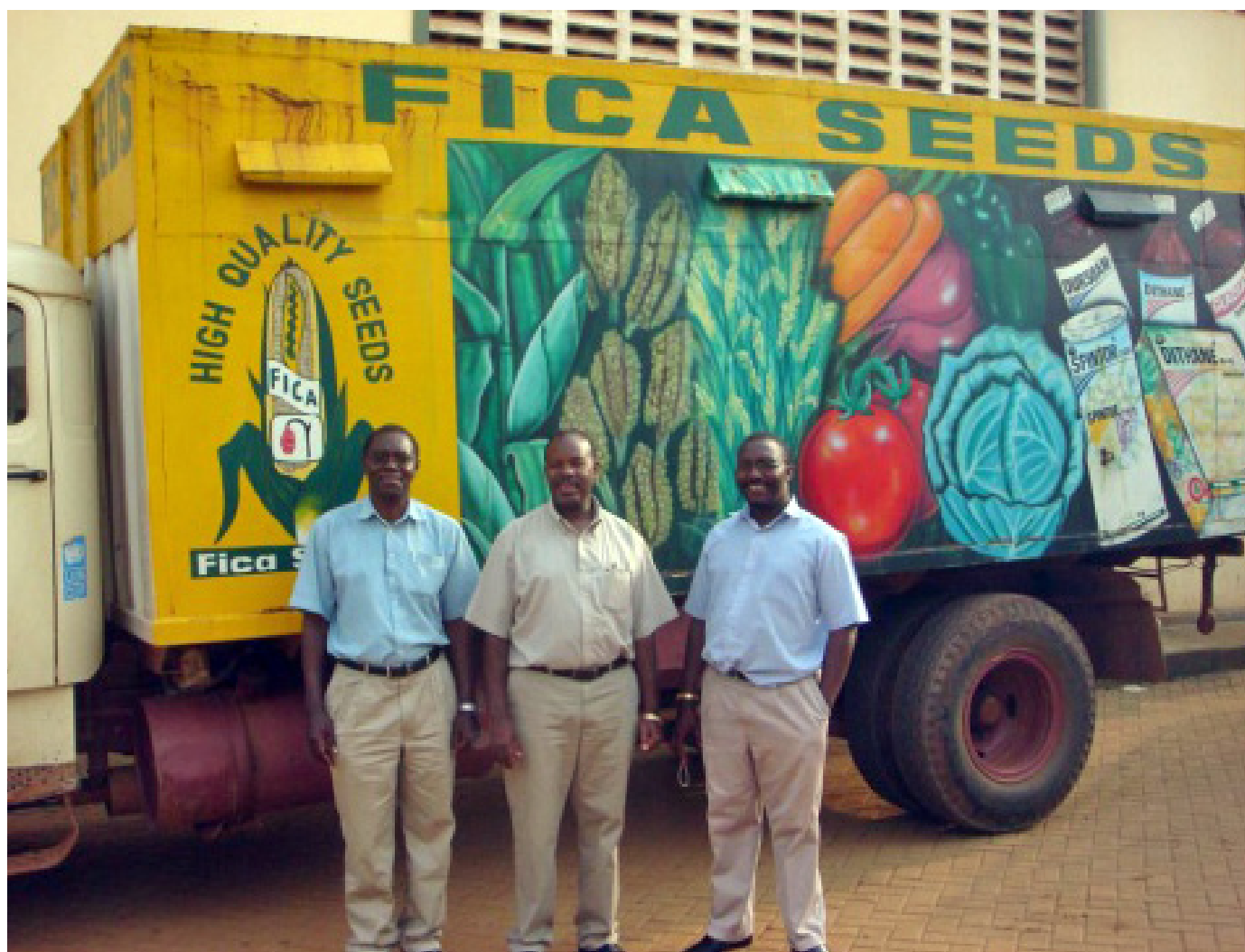
Uganda's Farm Inputs Care Centre (FICA) is one of many local seed companies that is scaling up production and distribution of certified seeds with support from AGRA.

to "agro-dealers" (see box on Malawi). An important component of its work, however, is shaping policy.