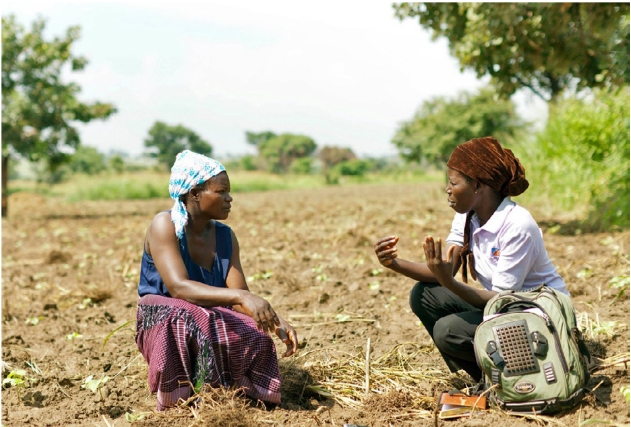
A junior business advisor for TechnoServe discusses farming techniques with a Ugandan farmer.