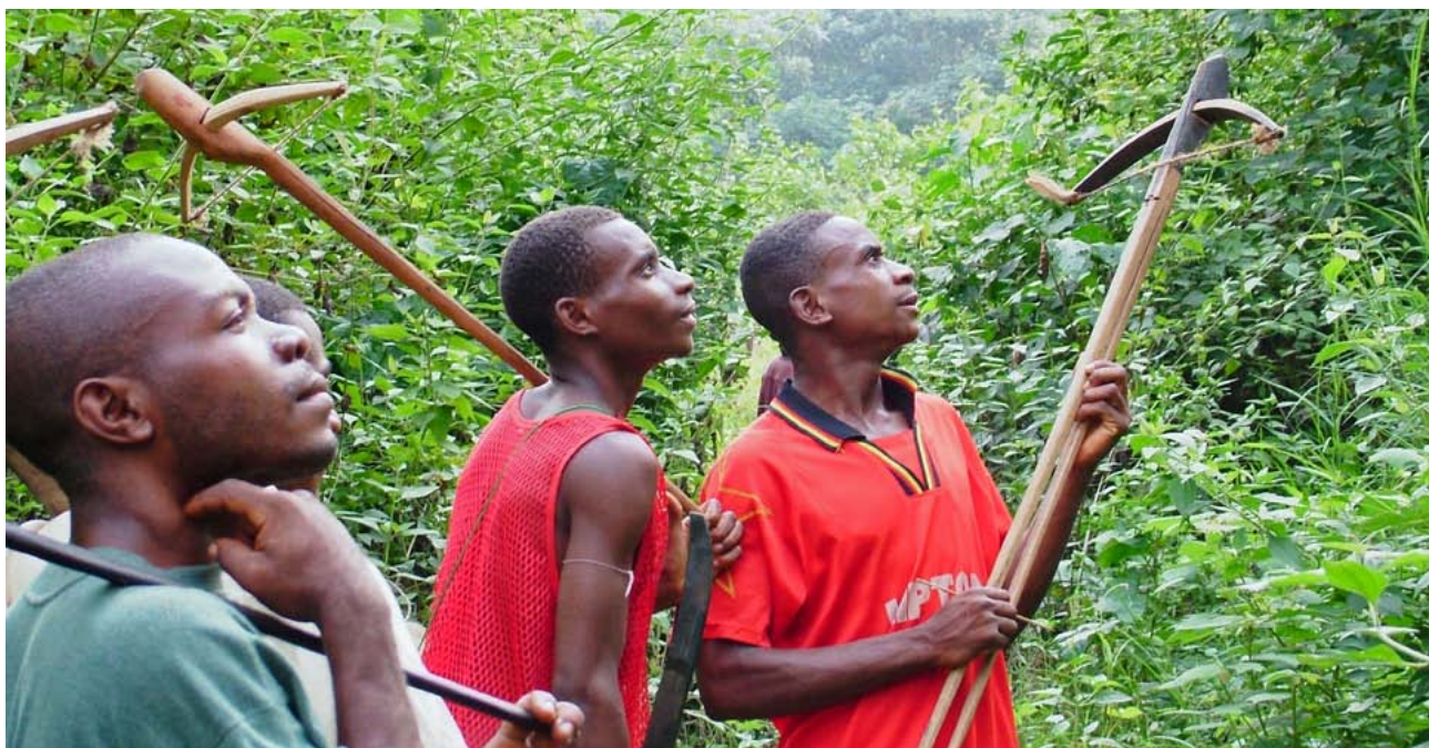
Bagyeli hunters

Group are also paid over 150,000 euros per year by DekelOil for office space in Abidjan and Israel, while another Rina Group subsidiary, Starten Ltd, gets regular payments from DekelOil that are not clearly accounted for in the company's financial statements: 50,000 euros in 2010, 141,000 euros in 2011 and 80,000 euros in 2012.