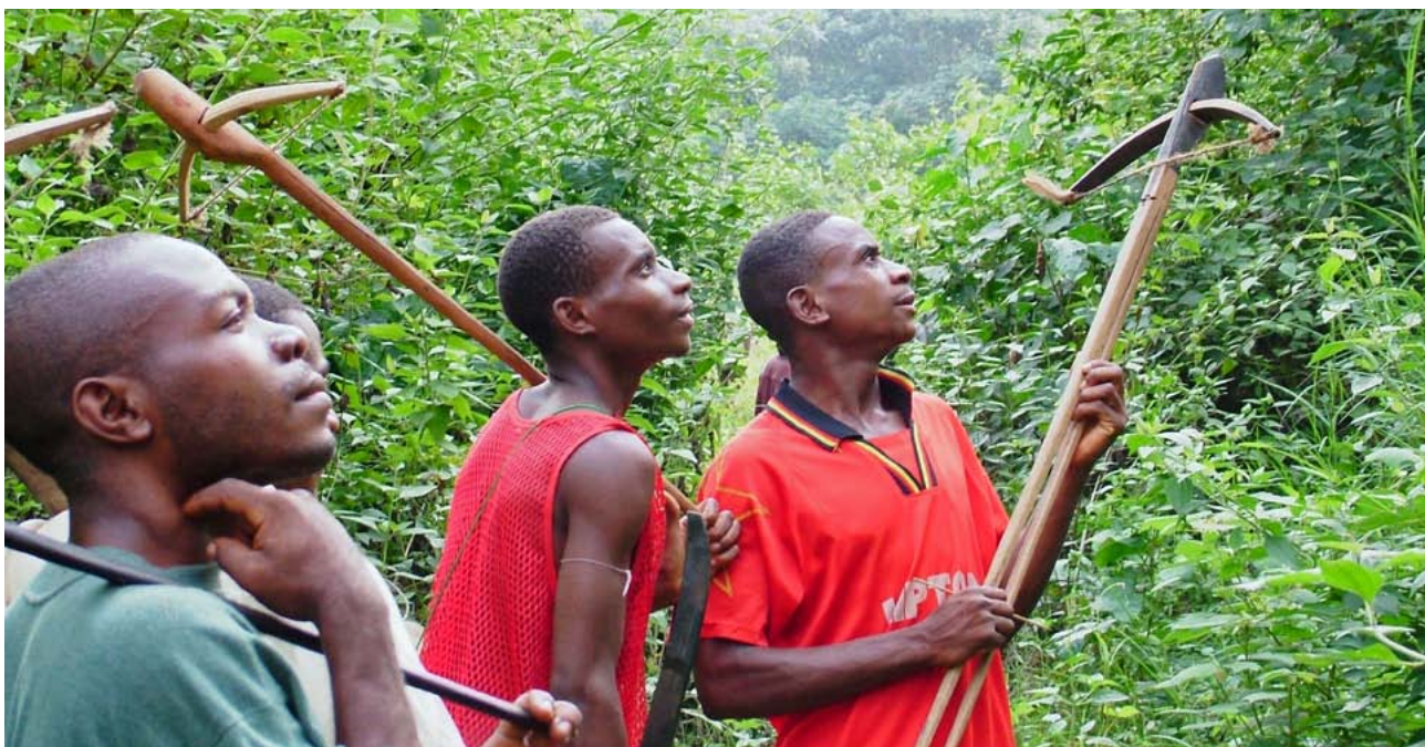
Bagyeli hunters

Group are also paid over 150,000 euros per year by DekelOil for office space in Abidjan and Israel, while another Rina Group subsidiary, Starten Ltd, gets regular payments from DekelOil that are not clearly accounted for in the company's financial statements: 50,000 euros in 2010, 141,000 euros in 2011 and 80,000 euros in 2012.