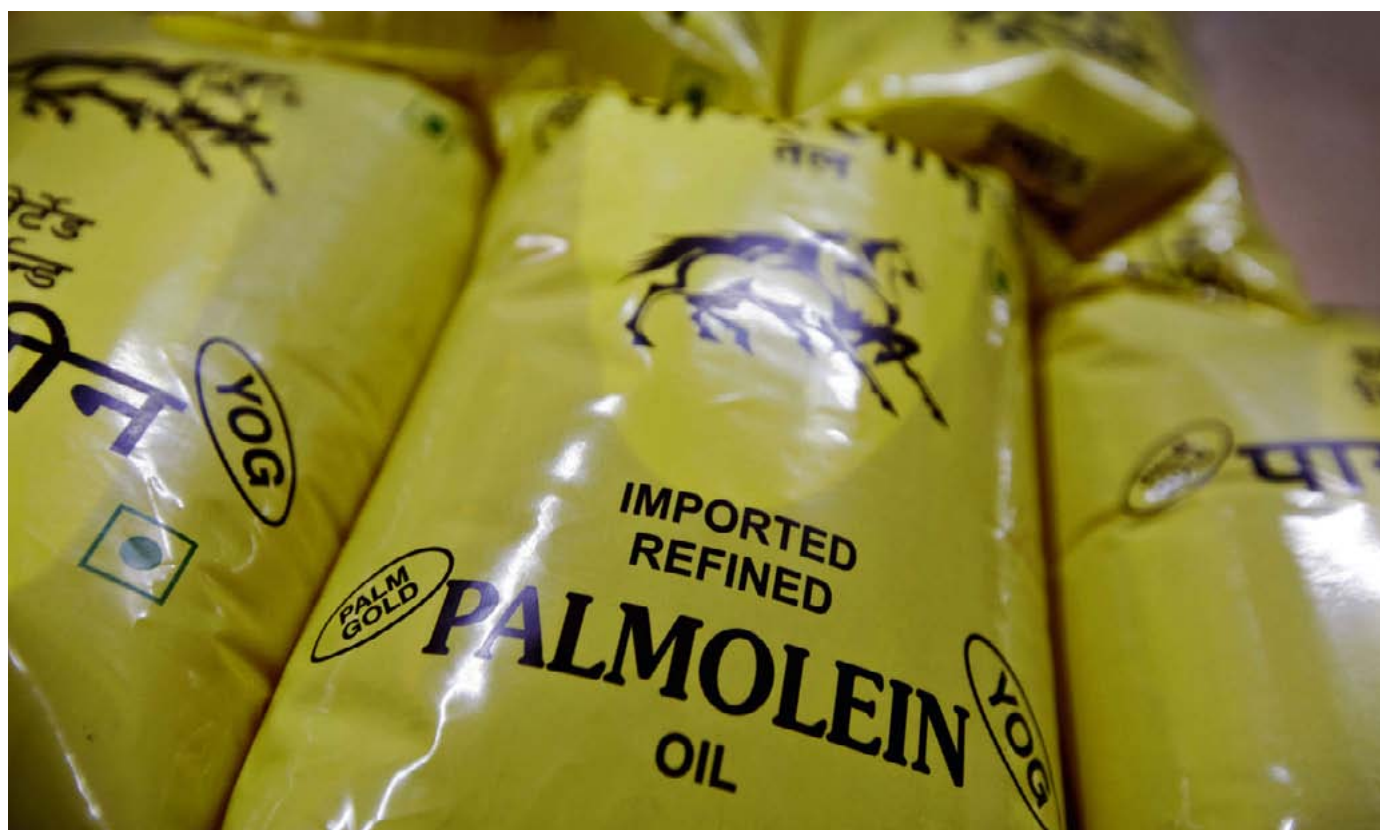
Bags of imported palmolein oil are stored at a warehouse of a cooking oil wholesaler in Mumbai.

The communities living on the lands are an afterthought, a potential obstacle to the money making. But they are the ones who ultimately pay the price.