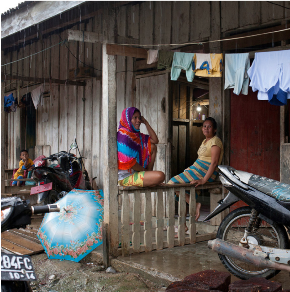
PT Hardaya Inti Plantations workers at one of the company's labour camps inside the Buol plantation: "No matter how hard we work, we are always in debt."

concession area, on lands that the provincial government would have to identify.