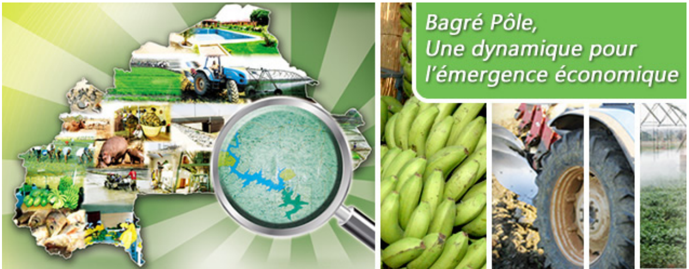
Donor funding is now tied to the implementation of policy designed to encourage large-scale private investment in areas like Burkina Faso's Bagré Growth Pole.

in the agricultural sector," and "percentage increase in private investment in commercial production and sale of seeds." 17