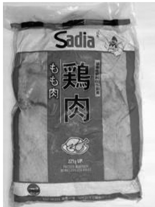
Brazilian chicken for sale in Japan