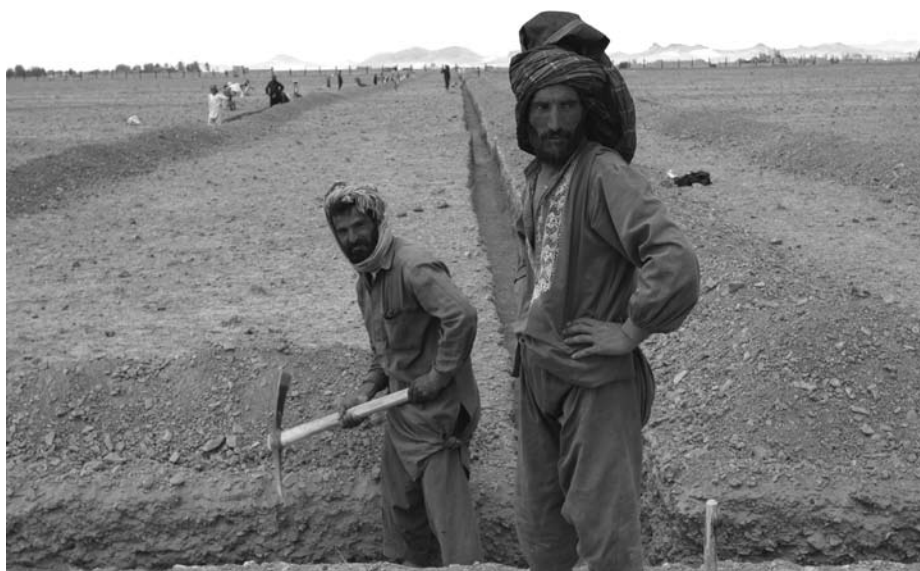
Afghan workers preparing fields of the US Agriculture Centre in Shindand

In the war in Afghanistan, bombs and food are a package deal. At the very airfield from which the US planes launched their deadly attack, US forces had established an agricultural training centre just months before. “The agricultural centre has many positive effects for both the troops and the local population,” says a leader with the US Special Forces civil affairs team. “This allows us to build a rapport with the villagers through education and employment; therefore, they are given a reason to think twice about allowing the anti-Afghan forces to step in and influence their lives in a negative way. The presence of this agricultural centre is a security measure in and of itself.” 2 Its explicit objective is to give a positive spin to the US occupation.