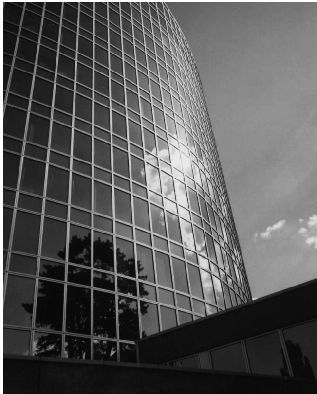
The WIPO building in Geneva, where UPOV is housed

Industry's wish list for the next revision of UPOV