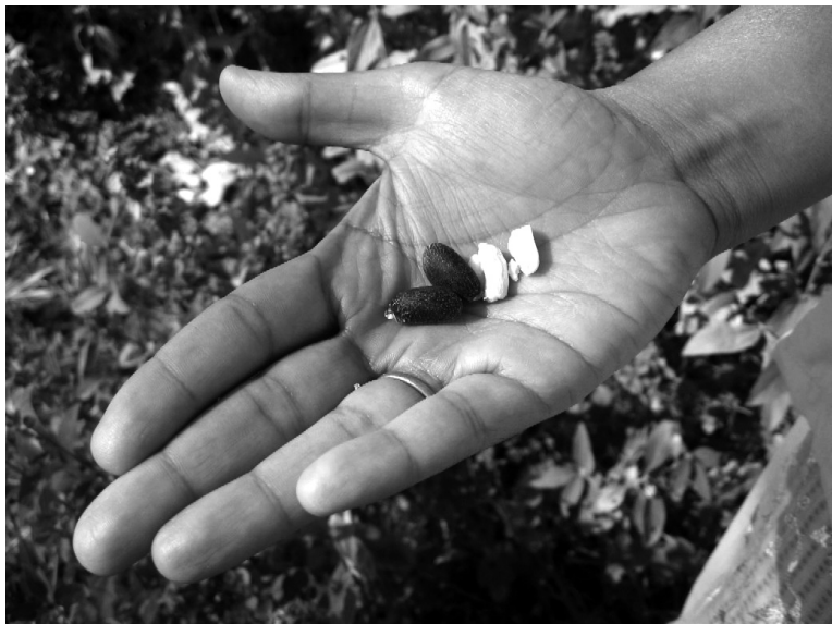
Jatropha curcus seeds, within and without their black shells

Jatropha fever is spreading everywhere. The Centre for Research and Application in Plant Tissue Culture in Hisar, Haryana, has provided over 100,000 jatropha plants to the farmers, and the Haryana Forest Department is creating 300 hectares of model jatropha plantations. Similarly, the Forest Department in Himachal Pradesh is itself distributing jatropha saplings for planting. Ironically, the promotion of jatropha is being carried out as part of a project to “green” the state. Meanwhile, there is growing concern about the future of ecologically sensitive areas – such as the Barnavapara National Park in Chhattisgarh – which will find themselves surrounded by a sea of jatropha.