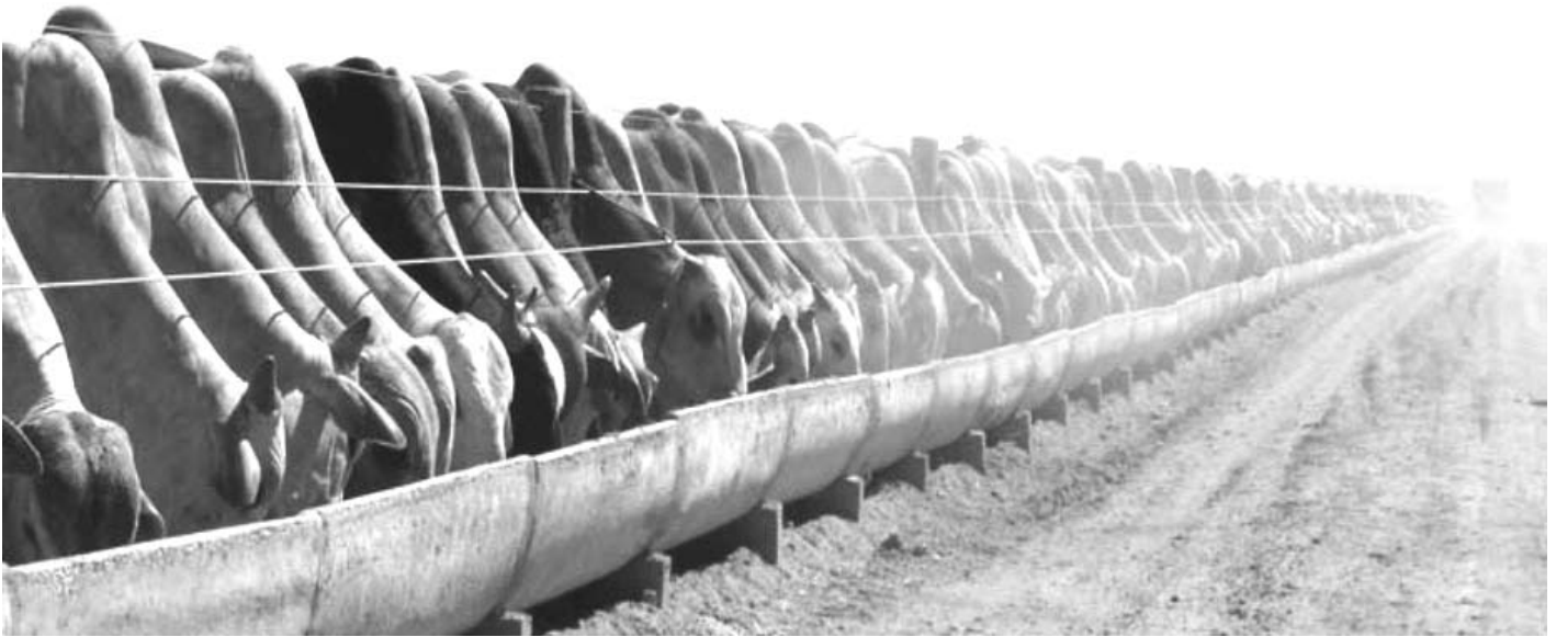
One of Brazil's new feedlots

what people often do not realise is that Brazil's JBS has progressively bought up the largest position in the US beef-packing industry. The cows may be initially reared by independent herders on US farms, but the feedlots, abattoirs and processing plants are mostly run and controlled by Brazilian executives.