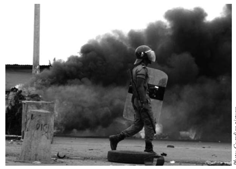
Policeman patrols a street after food riots, Cote d'Ivoire

Against this backdrop of bankrupt ideas and systems, there is no other credible way forward than to rebuild from the bottom up. That means inverting the power structure: small farmers, still responsible for most food produced, should be the ones setting agricultural policy, rather than the WTO, the IMF, the World Bank or governments. Peasant organisations and their allies have clear, viable ideas about how to organise production and services and how to run markets and even regional and international trade. Ditto for labour unions and the urban poor, who have an important role