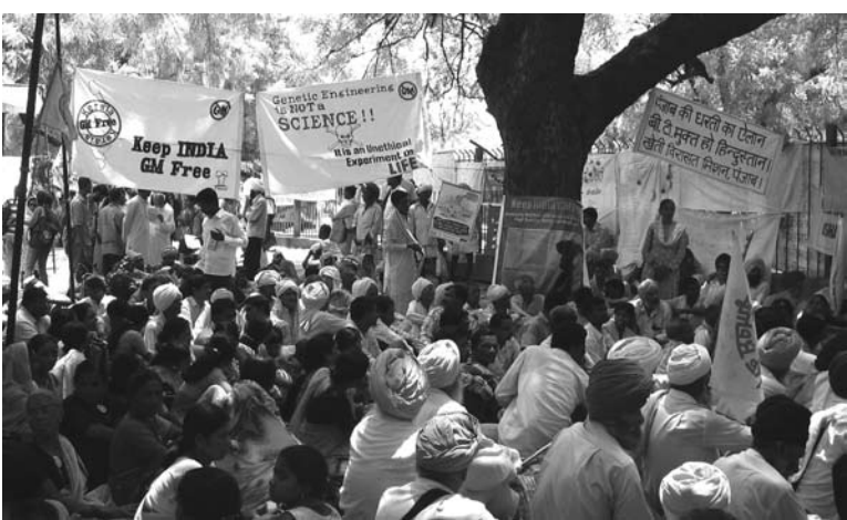
Anti-GM protest, Delhi, India