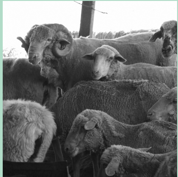
Sopravvissana sheep - in demand, but out of reach for farmers

But the herders need some kind of public support. "I can't make a gift of these sheep" they say. Which is true. The most productive sheep in Italy now - the Sarda - can give up to one litre of milk per day, while the Sopravvissana produces only one-fifth of a litre. The herders have made a conscious decision to keep the traditional sheep and they have a right to some kind of non-monetary compensation.