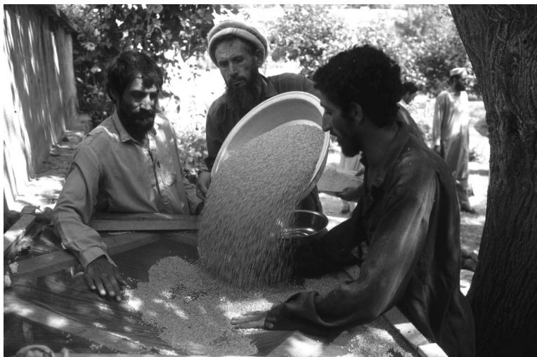
In Afghanistan, farmers' seeds that are not sold commercially are exempted from registration and certification

Certification goes hand in hand with seed quality control in which the most important seed qualities - viability, purity and health - are tested in a laboratory, commonly using internationally harmonised procedures of the Organisation for Economic Cooperation and Development (OECD) or International Seed Testing Association .