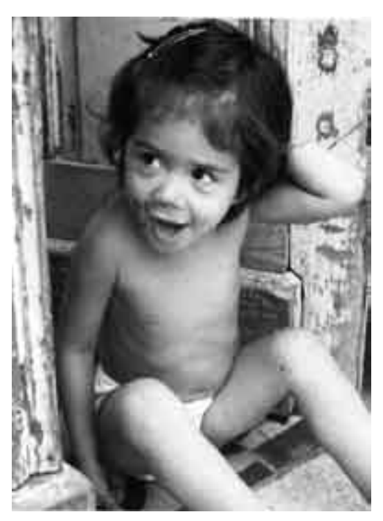
Soya is recognised as being unsuitable for children under five, and yet it is being fiercely promoted for all children.

Some NGOs are exploring the possibility of sustainable soybean production. This case study demonstrates that it is simply not possible. Nor is the production of GM crops a solution to hunger. Quite the opposite: as GM soybean production has grown, hunger has skyrocketed to levels never seen before. Any idea that the use of agrochemicals would be reduced is also an illusion. Argentinean agriculture has not only become dependent on