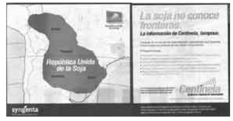
The "United Republic of Soya" - ruled by corporations, and where national boundaries become irrelevant. "Soya knows no boundaries", says Syngenta.

In the 19th century, the region of Santiago del Estero supplied the rest of the country with agricultural products. The beginning of the 20th century saw the massive extraction of timber to make more than 20 million sleepers for the new railway system. Much of the mobile labour force that carried out this work settled on the land afterwards. The law says that if people settle on a piece of land for 20 years it becomes theirs, but the process of proof is complex. The province has long been subject to almost feudal rule, with rampant deforestation and the concentration of land in the hands of the few. Many long-established peasant communities have been approached by someone who claims to own their land. If they refuse to leave, armed groups may steal their cattle, burn their crops and threaten them with violence. Once they are dislodged, the situation