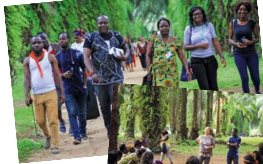
The regional alliance against corporate oil palm plantations in West and Central Africa held a number of key strategy meetings and convergences in 2019

The regional alliance against corporate oil palm plantations in West and Central Africa is made up of around a dozen small grassroots organisations defending their community's control over their territories from companies that are trying to take lands for oil palm and other industrial plantations. The alliance works by connecting grassroots leaders, especially women leaders, enabling them to share experiences, devise strategies and collective actions, build tools and unite their voices and struggles within the region and internationally. The alliance has converged over the past six years with coordination support from GRAIN and the World Rainforest Movement (WRM) and has now consolidated into a locally-led resource for communities and groups across the region for the fight against oil palm plantations.