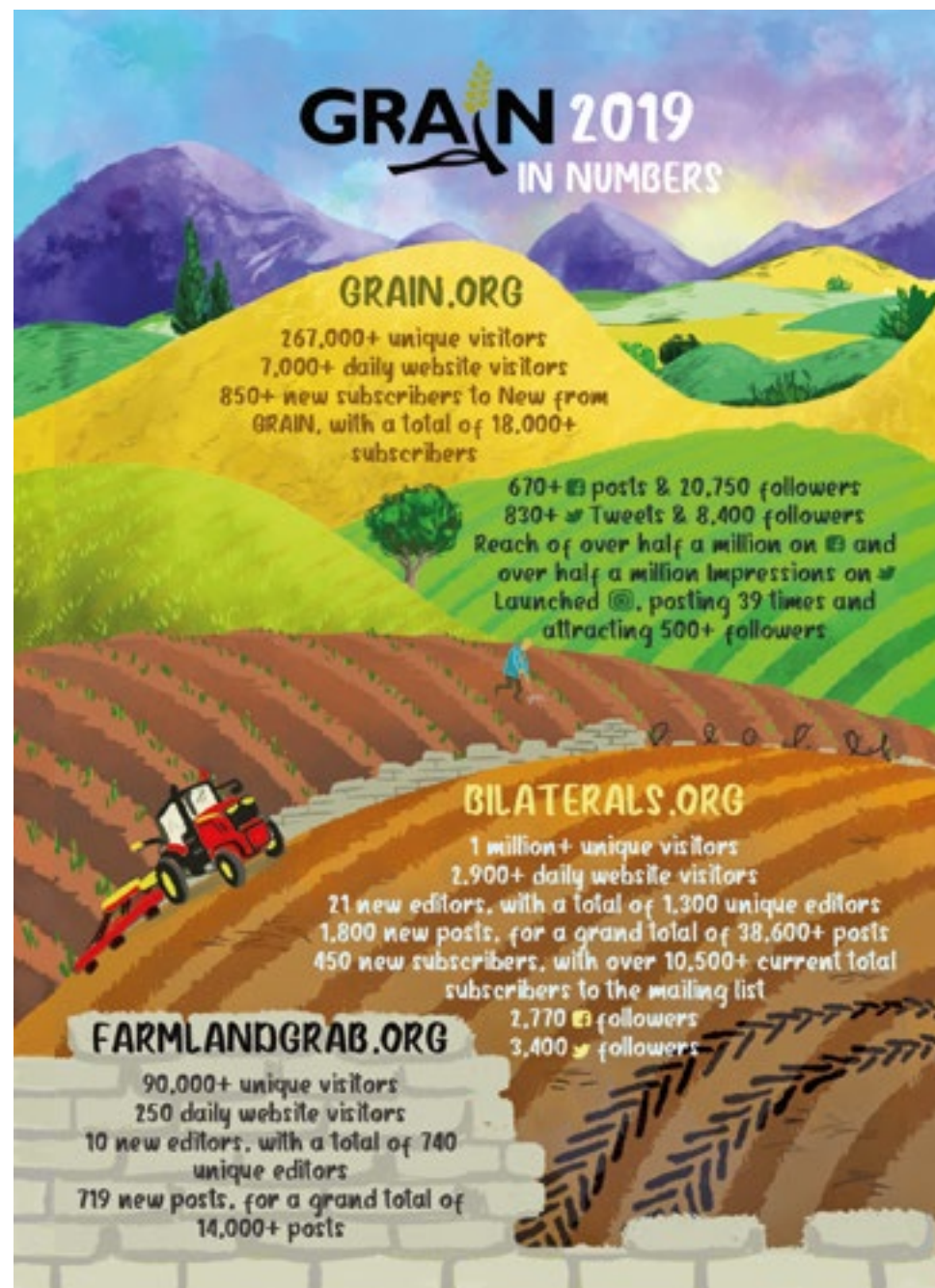
Illustration by Megan Basaldua, www.basalmegvinegar.com

We also know that our materials are replicated beyond our capacity to track and quantify: videos are seen at group viewings, materials are read over community radio and data is shared in presentations and list serves. Our resources also have an important role in print. Our staff share copies of reports at strategy meetings, infographics get printed on flyers at rallies, and magazines are making the rounds at workshops around the world. Here is where our materials really hit the ground, helping to shape strategy, inform campaigns, and strengthen arguments.