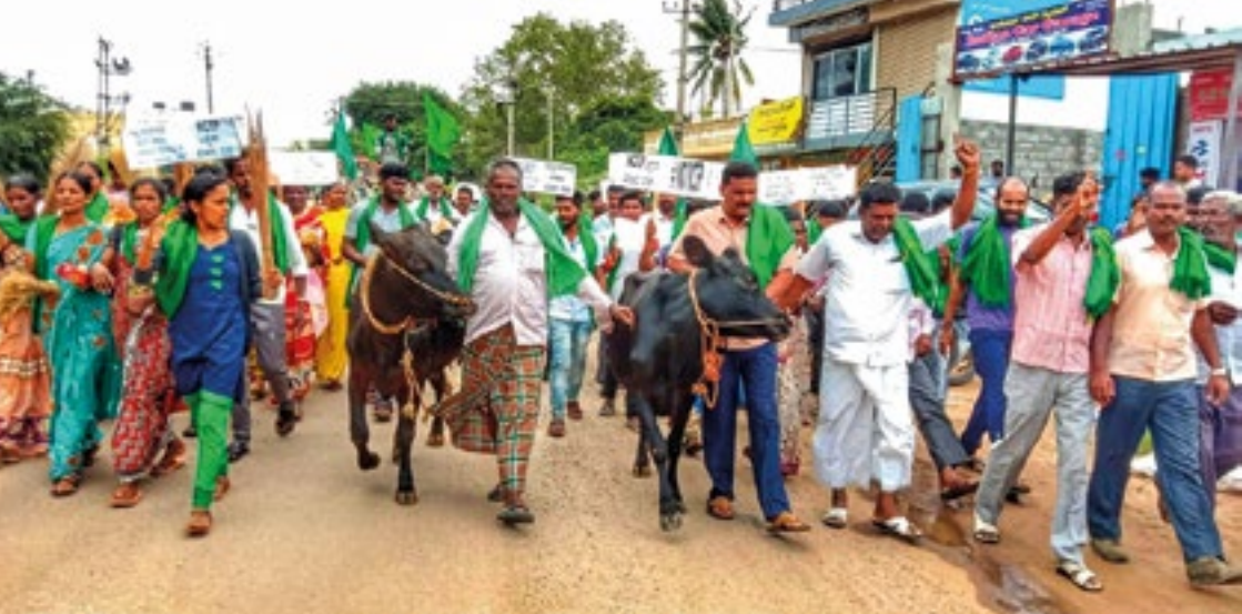
Dairy farmers in India march in protest of the Regional Comprehensive Economic Partnership. As a result of pressure from farmers and civil society, India pulled out of negotiations in November 2019.

6 explaining the potential impact of RCEP on both land grabbing and the dairy sector in India , foreseeing the extremely important role of the dairy industry in these trade negotiations. We helped groups get their message out in the press and also spoke to the media with a clear message: keep agriculture and dairy out of RCEP negotiations.