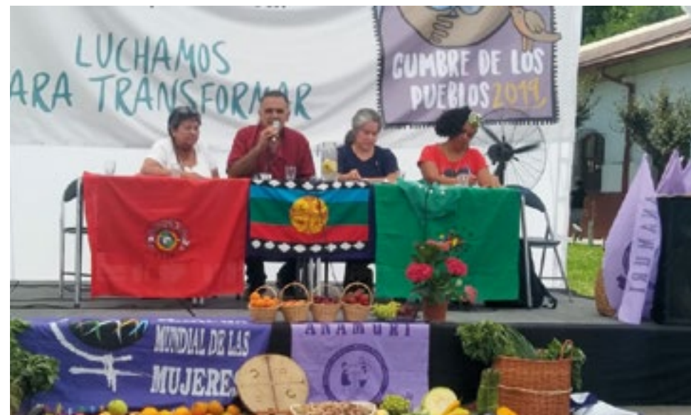
GRAIN staff gave multiple presentations at civil society summits parallel to the COP25 in Santiago and Madrid linking the industrial food system to the climate crisis and offering agroecology and food sovereignty as solutions.

GRAIN's climate audit of the EU-Mercosur free trade agreement calculated anticipated emissions from key agricultural products. The report and helpful graphics were picked up by media and movements across the world.