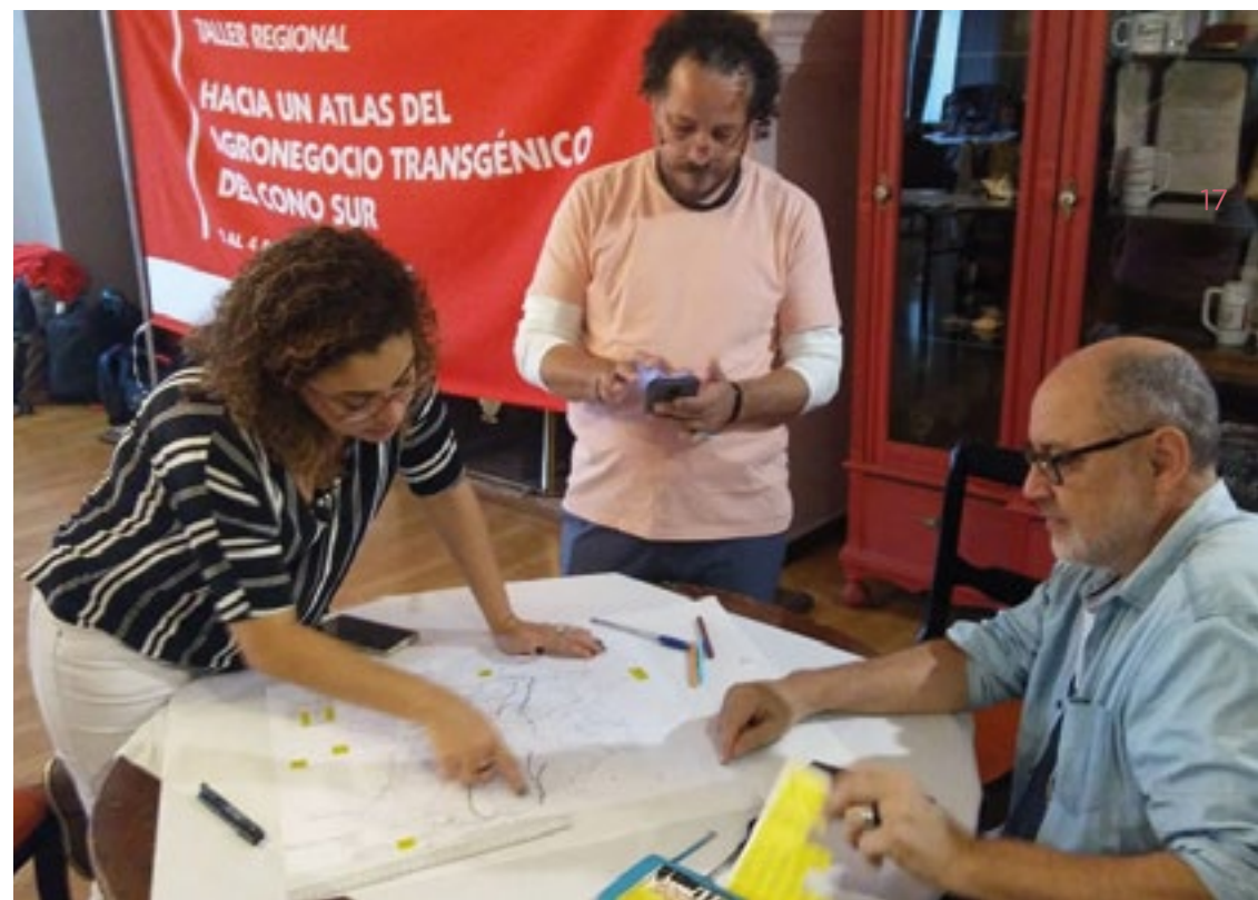
GRAIN staff participates in building an atlas of agrobusiness operations in the Southern Cone in Paraguay, 2019

Prior to the meeting, participants engaged in a participatory workshop building the atlas of agribusiness and GM crops in the Southern Cone. The workshop engaged with over 40 representatives from peasant, social, ecological and communications groups from the Southern Cone, including participants from the GRAIN team who brought over 20 years of research on the impacts of the imposition of genetically-modified and glyphosate-resistant soy in the region. The forthcoming multi-media project analyzes GMOs and big infrastructure projects and their effect on land, seeds, water and biomes – plus highlights the resistances of the social movements, local communities and especially women movements.