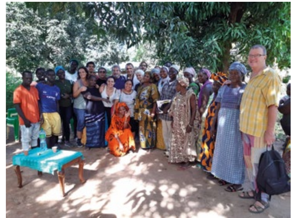
GRAIN's 2019 annual partner meeting took place in Senegal in October and focused on issues of climate and trade. With around 20 partners from 10 different African countries, plus GRAIN staff, the meeting provided a space to discuss the connections between trade, food and climate change. We left the meeting with new strategic thinking and ideas about how we can build cooperation between climate justice groups focused on energy and food sovereignty groups focused on supporting agroecology and peasant seeds across Africa. Here our staff meets with partners in the Casamance region of Senegal during our annual staff meeting.

convergence of the climate crisis and rising food imports in Africa is a recipe for catastrophe. Focusing on the vulnerabilities of the current dominant food system in Africa, the report Africa and climate: Food sovereignty is Africa's only solution to climate chaos details how food sovereignty is the only option that will protect the environment, feed the growing population and reduce climate impacts. Touching on trade, seeds, government programs and corporate initiatives, the report emphasizes the importance of prioritizing local food producers – predominantly women, local crops, local knowledge and local biodiversity as the key links to safeguarding Africa's food system against impending crises.