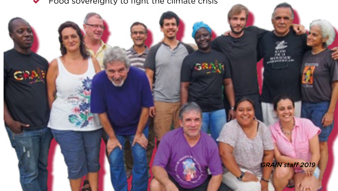
GRAIN staff 2019