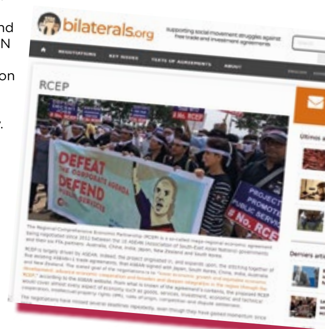
The new version of the bilaterals.org website provides a dedicated space to specific regional trade agreements like RCEP as well as a new design, enhanced search engine and materials in multiple languages

The scope of the project continues to develop: the team often responds to ad-hoc requests from groups globally, from creating new pages to publishing leaks of draft negotiating texts or other undisclosed documents.