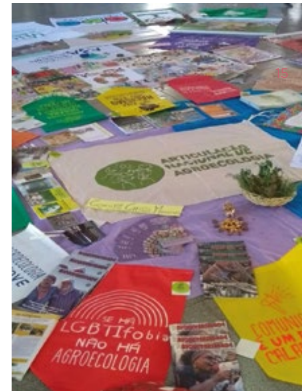
GRAIN materials join many others at the National Articulation of Agroecology (ANA) in Curitiba, Brazil

In March, GRAIN staff helped coordinate the Annual Assembly of the Network in Defence of Maize in Mexico, with over 500 people from at least 16 states around the country. This meeting between people and communities that defend the life of “people who defend and live with maize” was a real success. In September and October, we participated in preparing a collective declaration against the newest law to supposedly protect maize in Mexico. We worked with groups to issue