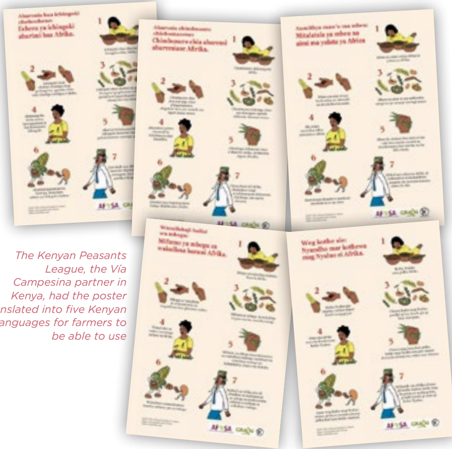
The Kenyan Peasants League, the Via Campesina partner in Kenya, had the poster translated into five Kenyan languages for farmers to be able to use

documentary and short animation. The short has also been translated this year into German, French and Italian. We then ventured into the world of online courses with Instituto La Fuente and Alianza Biodiversidad, offering a course with the same theme as these resources, Seeds, commons or corporate property? It was offered in Spanish with around 100 participants from around Latin America.