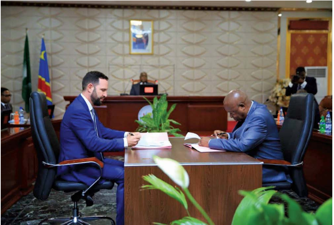
The DRC Minister for Agriculture and a Vital Capital representative signing in 2019 a memorandum of understanding to launch five agro-industrial zones across the country, with a cost of US$150 million.

Under the plan, Suriname is supposed to pay off the loan through the sales of eggs, milk and other foods produced on the farm. But Ramautarsing says the plan overestimates the market price for these products, and there are insufficient markets to absorb the quantity of production that is envisaged.