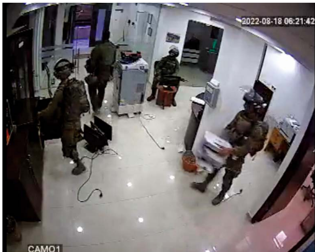
Raid of UAWC's offices by Israeli forces, 18th of August.

"I used Israeli chemical pesticides in the previous two years. The biodiversity in my field was destroyed, especially bee hives and