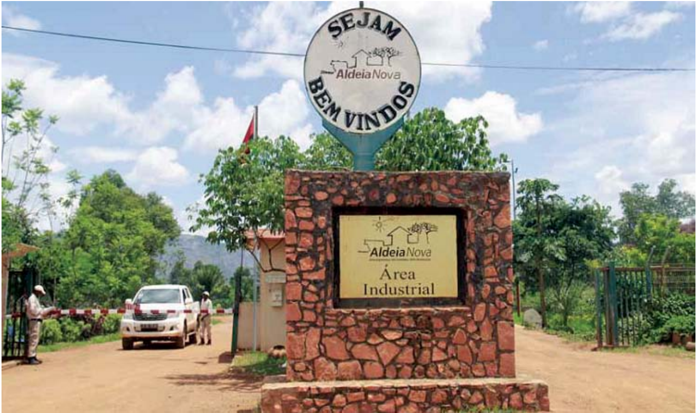
LR Group/Mitrelli Group project Aldeia Nova in Angola.

the company. They have to pay the company for the use of the houses, the infrastructure, the small plots of land and the inputs that they are supplied. Everything they produce goes to the company, and in return the villagers get very little, as they must pay off their debts (see the case of Aldeia Nova in Annex I ).