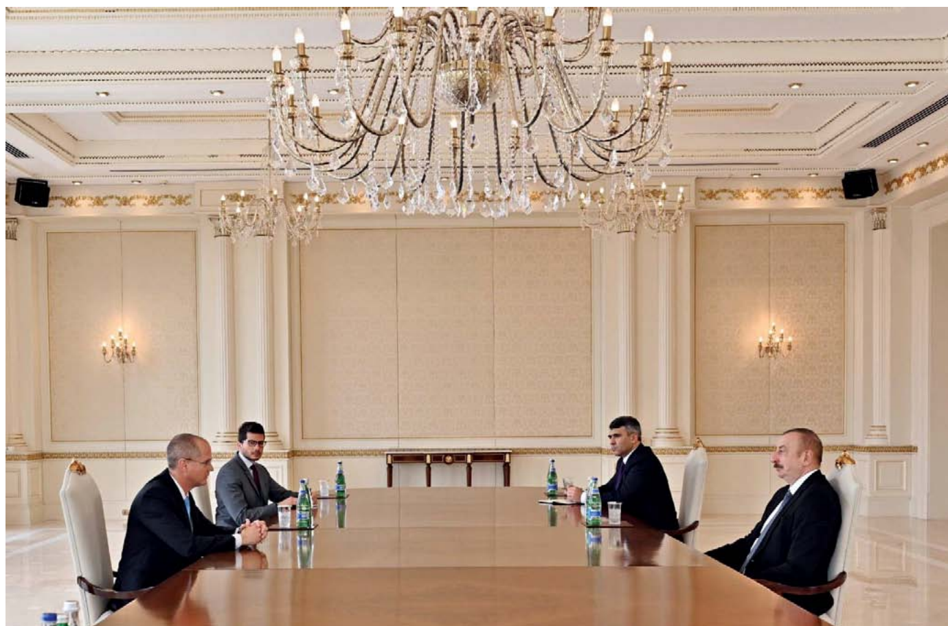
Azerbaijan’s President Ilham Aliyev meeting in May 2022 with Israel Minister of agriculture and rural development Oded Forer.

The Israeli agricultural operations in Angola produced few benefits for the local people, but they were effective in cementing ties between Israel and Angola’s ultra-wealthy political elites, and they generated huge sums of money for Israel’s emerging cluster of companies and businessmen specialising in overseas agribusiness projects (see Annex 1). The Angola projects effectively became a model for other Israeli companies, and the actors behind the operations in Angola, and others who have followed in their footsteps, are now