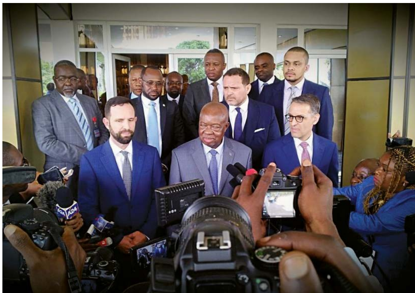
The Minister of Agriculture of the Democratic Republic of Congo, Jean Joseph Kasonga, with a delegation from Vital Capital Investments, Saturday 7 December 2019.