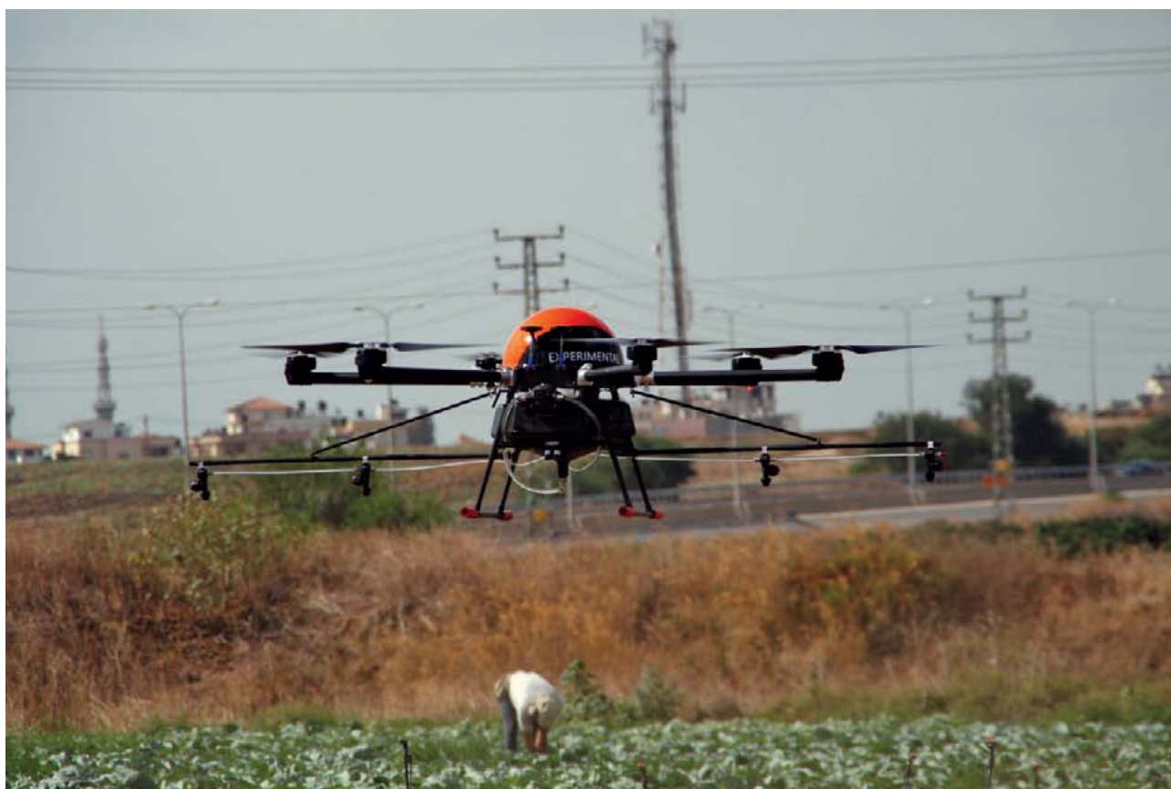
Drone for agricultural use.

Among the companies travelling with the Israeli Minister of Agriculture to Azerbaijan in May 2022 were several that have been singled out by human rights organisations for directly profiting from Israel's illegal occupation of Palestinian lands. 32