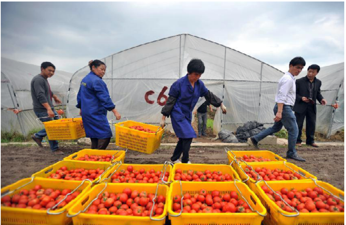
Farmers pack tomatoes in Guandao village, southwest China, during the 2014 spring harvest.