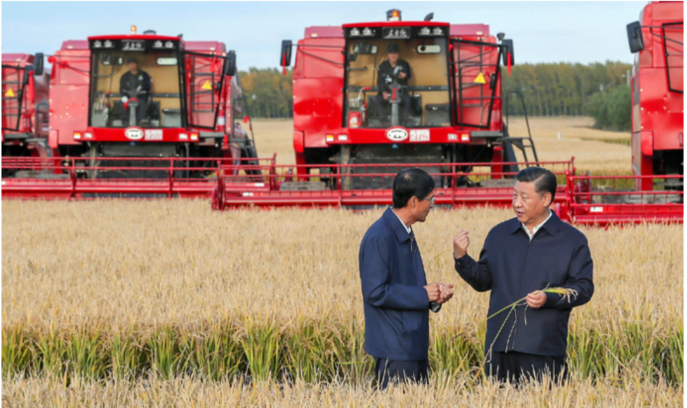
Chinese President Xi Jinping visits Heilongjiang province, China, in September 2018.

nine special economic zones. 6 Projects include the construction of a fertiliser plant with an annual output of 800,000 tons; large-scale vegetable and grain processing plants in Asadabad, Islamabad, Lahore and Gwadar; and a meat processing plant in Sukkur. Hundreds of thousands of hectares of farmland will be needed for these projects, with many farmers likely displaced.