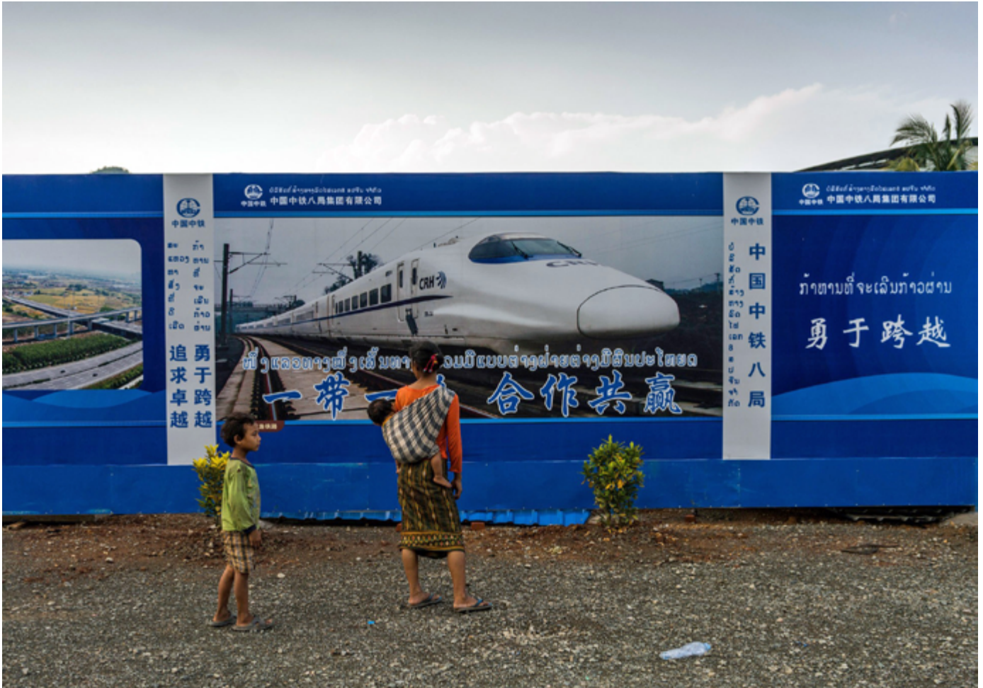
Poster for a Chinese high-speed train at the construction site for a bridge over the Mekong River near Luang Prabang, Laos.

million hectares in 31 countries. 12 It is unclear exactly how many of these deals are directly tied to BRI-associated projects, but BRI is certainly helping to increase China's control over the world's farmland.